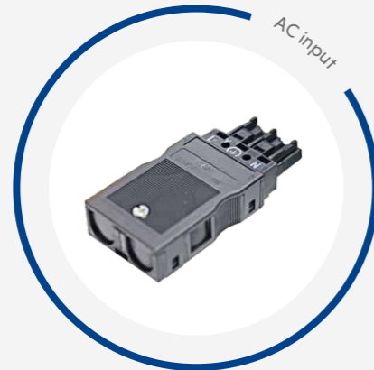
Plug & Play